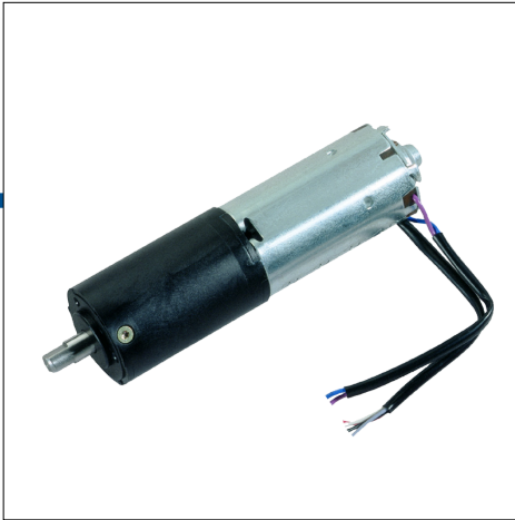
Planetary Gear Motor

Motors and gear motors for use in packaging equipment, conveyors, dispensers and sorting equipment.