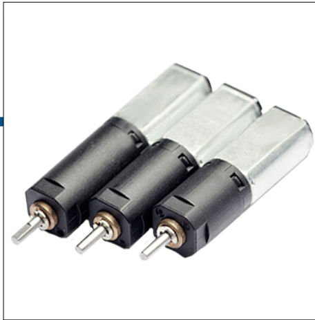
Planetary Gear Motor