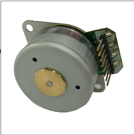
Outer Rotor BLDC Motor

Motors and gear motors for use in electric shades & blinds, white boards & projector screens, heating & ventilation controls, and louvers.