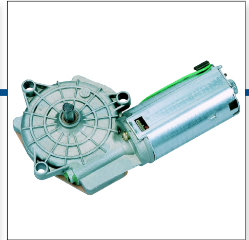
DC Worm Gear Motor