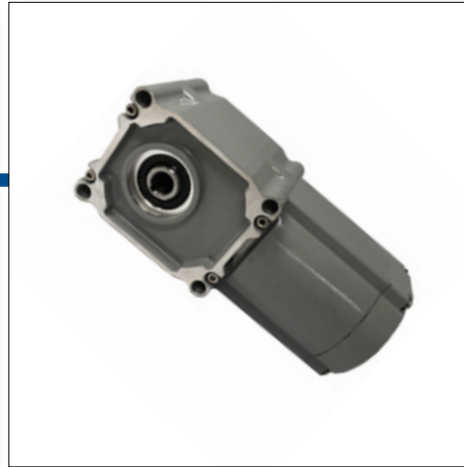
Hypoid Gear Motor