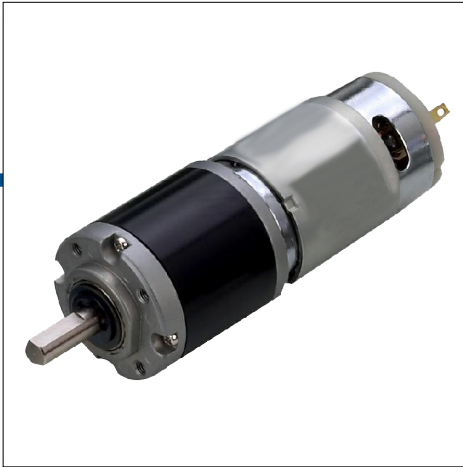
Planetary Gear Motor

Motors and gear motors for use in agricultural equipment.